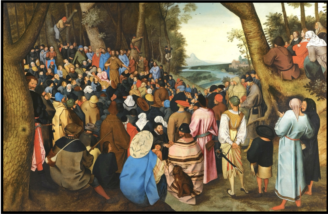
“John the Baptist Preaching to the Masses in the Wilderness” by Pieter Bruegel, 1601

Congregational † United Church of Christ